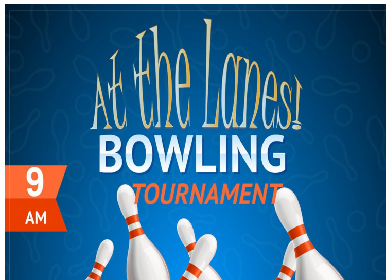
Table Sponsor: $200 (display table at event, logo on promo material)

Lane Sponsor: $250 (lane banner & logo on marketing material)